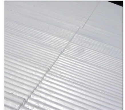
After the cool protective Topps Seal™.

After considering all the roofing options available to them, Topps Seal™ was selected for its ability to solve maintenance problems while simultaneously providing maximum cooling to this non air-conditioned